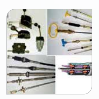
Mechanical Control Cables Cable Assemblies

Avdel India supplies a wide range of hardware products which are used by the Aerospace, Transportation, Defence and other Allied industries. The hardware include Mechanical Control Cables, Hoses, Sleeves, Conoseal fittings, Clamps, Shims etc.