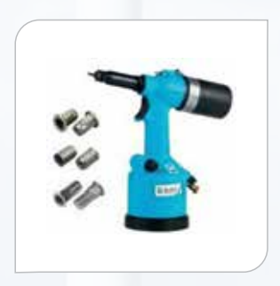
Rivnut Installation Tool