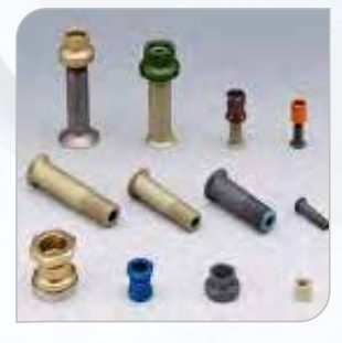
Hi-Lok® & Hi-Lites®