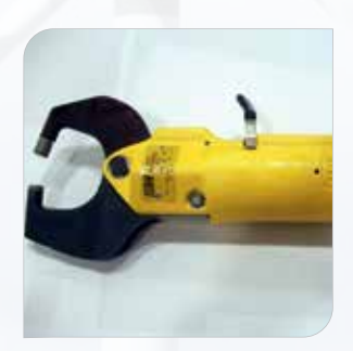
Solid Rivet Squeezer