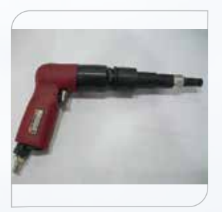
Visulok Installation Tool