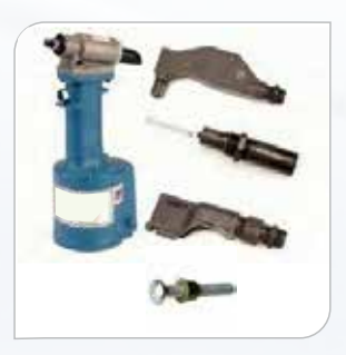
Blind Riveting Tools