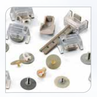
Adhesive Bonded Fasteners