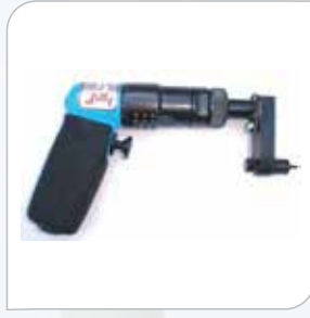
Hi-Lok® Installation Tools