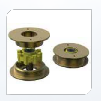
Isolator: Honeycomb Panel Inserts