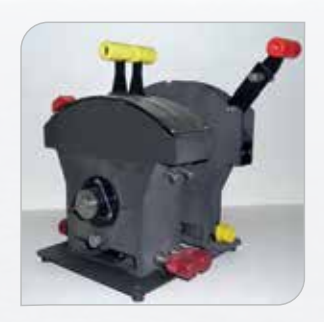
Cable Control Box