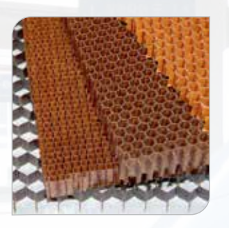
Nomex & Aluminimum Honeycomb

The Honeycomb materials include Aluminum, Nomex, Kevlar, Glass, Carbon, Silica, Quartz and Hybrid materials.