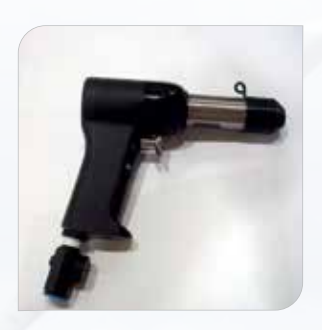
Solid Rivet Hammer

Our dedicated technical support team, having in-depth knowledge of fastener products offers appropriate tool selection and tool servicing to ensure optimum cost & minimum downtime for the various fastener installation tools. We also undertake Annual Maintenance Contract for these tools.